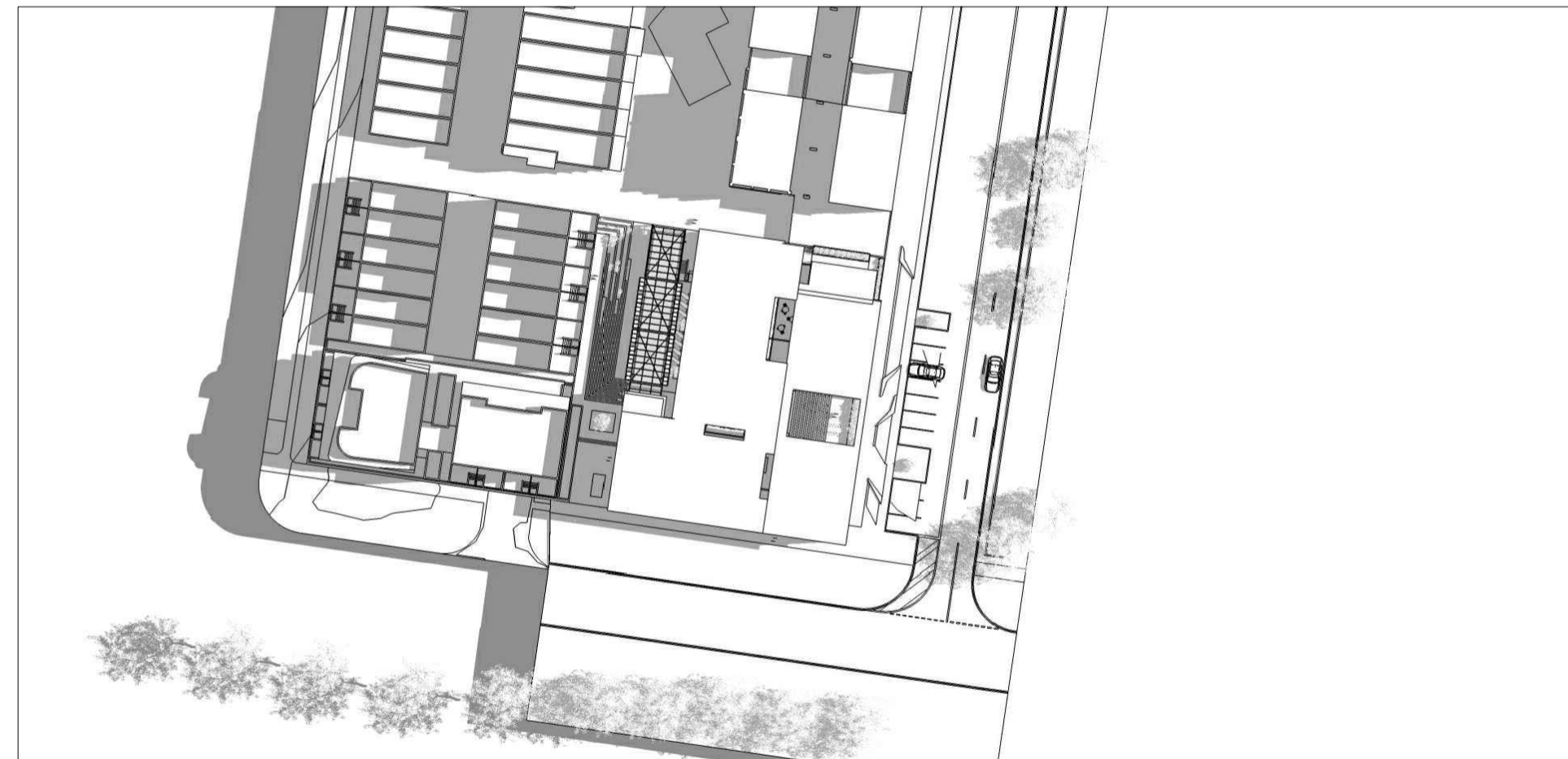
SUMMER 09:00 AM Shadow Diagram NTS