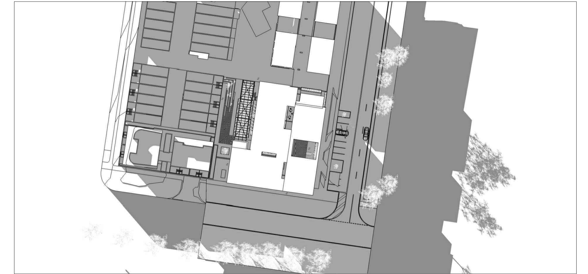
WINTER 15:00 PM Shadow Diagram NTS