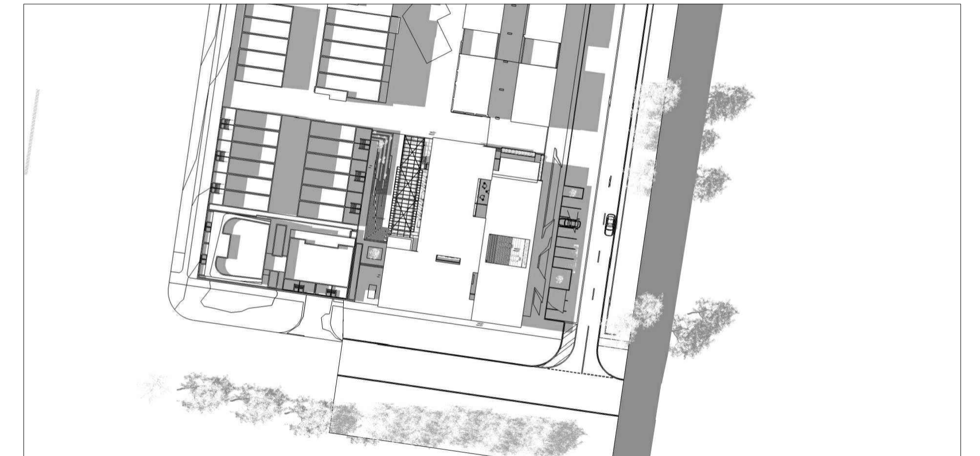
SUMMER 15:00 PM Shadow Diagram NTS