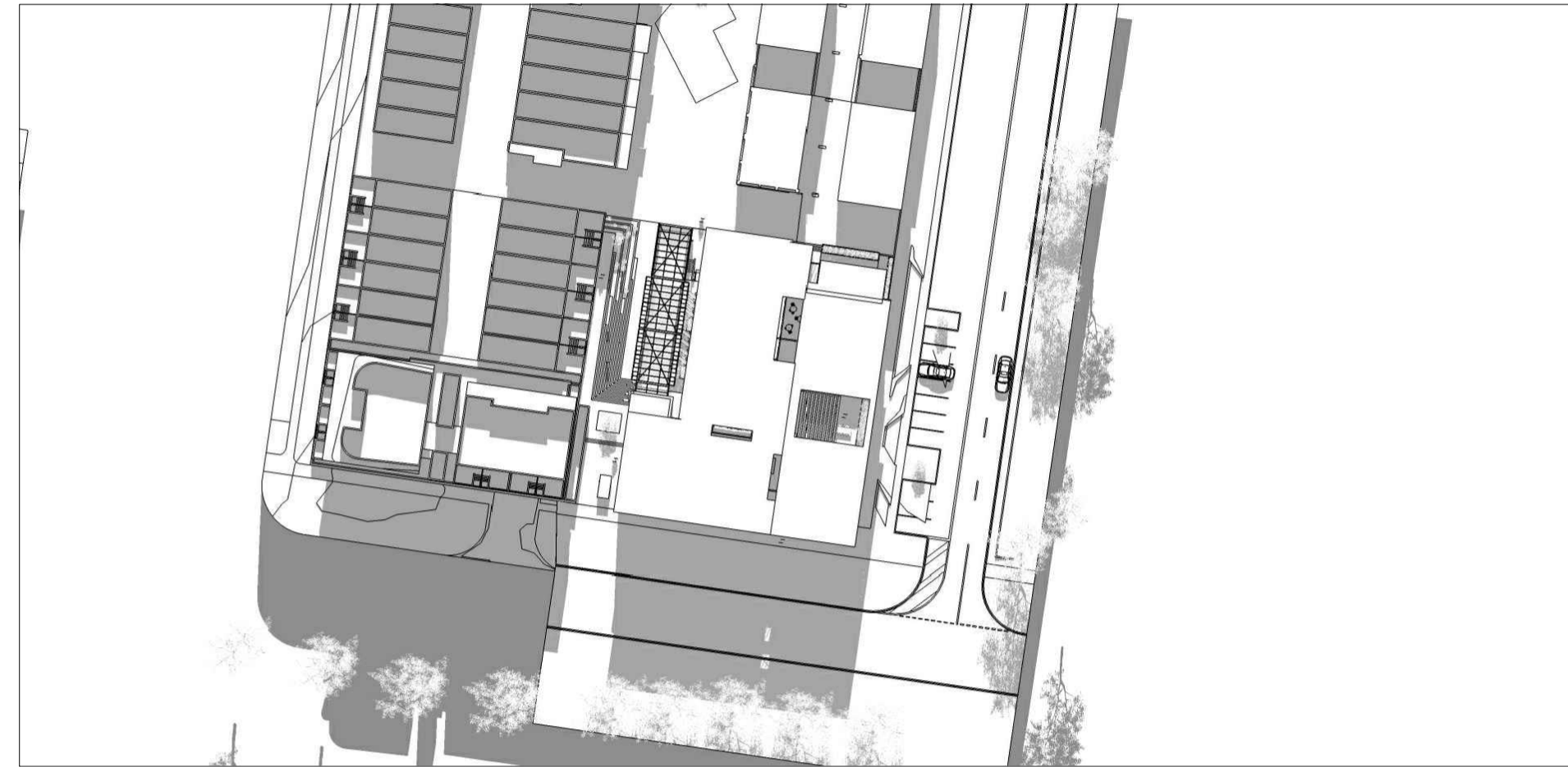
WINTER 12:00 PM Shadow Diagram NTS