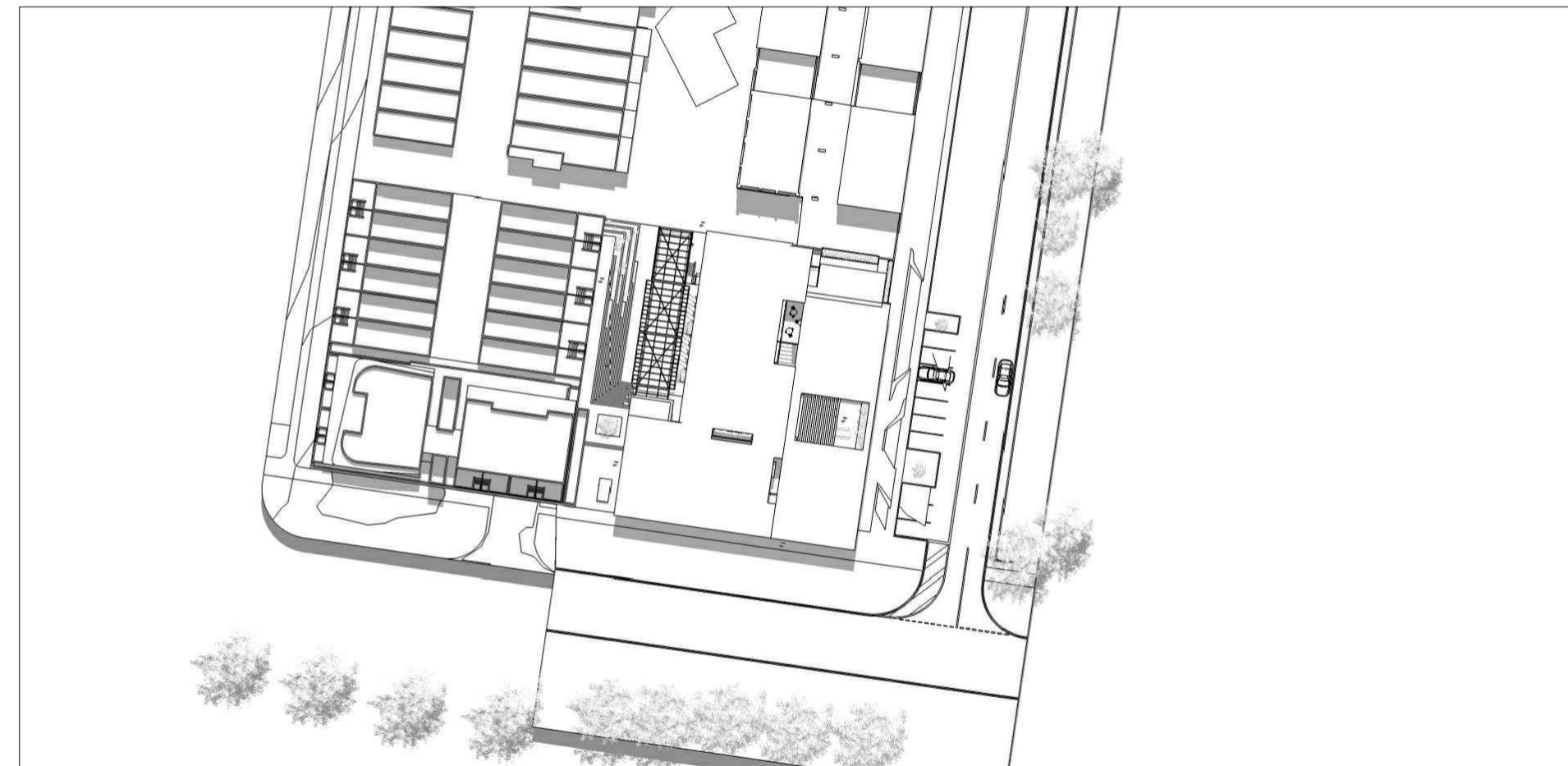
SUMMER 12:00 PM Shadow Diagram NTS